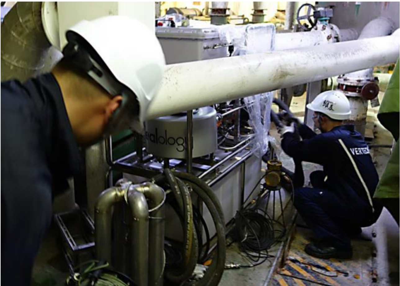
Fig1. Vertechs REALology is deployed in a confined & limited space on the drilling platform

Since the high challenges on fluids loss and possible kicks according to drilling fluids design, well control is critical to successful operation, close monitoring of drilling fluids properties is one of the key methods to prevent downhole problems.