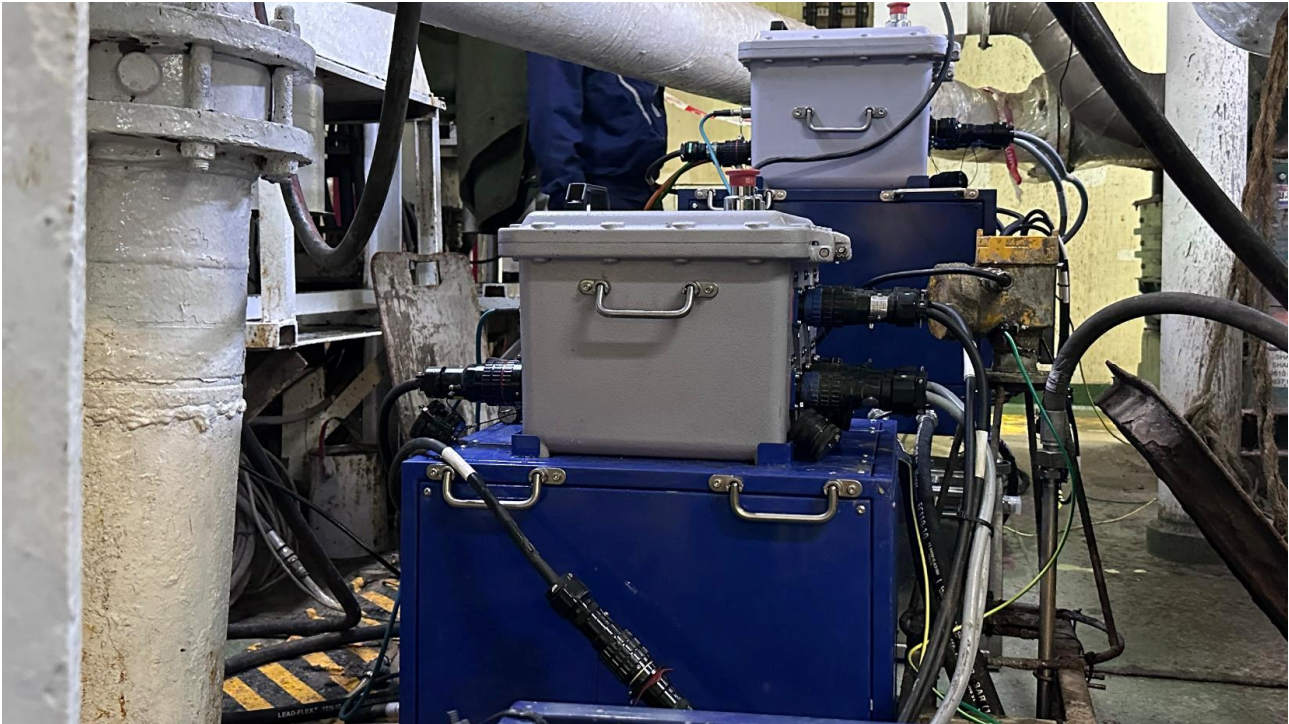
Fig1. Vertechs REALology is deployed in a confined & limited space on the drilling platform